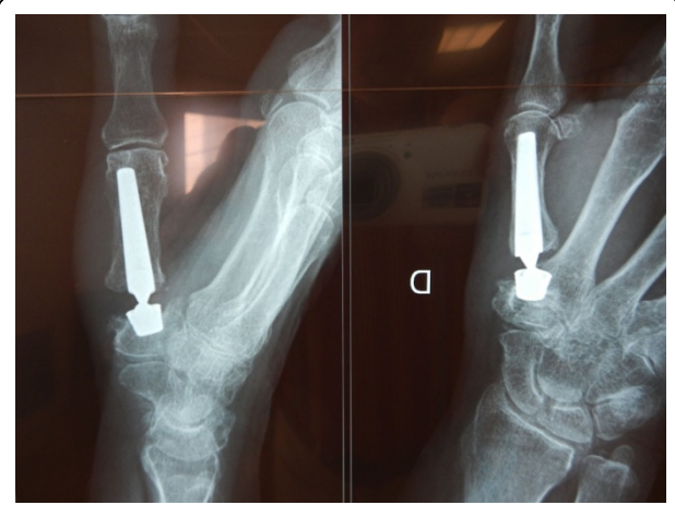
Figure 2 Moovis impacted into the Trapezium

Finally when STT osteoarthritis was present it was always