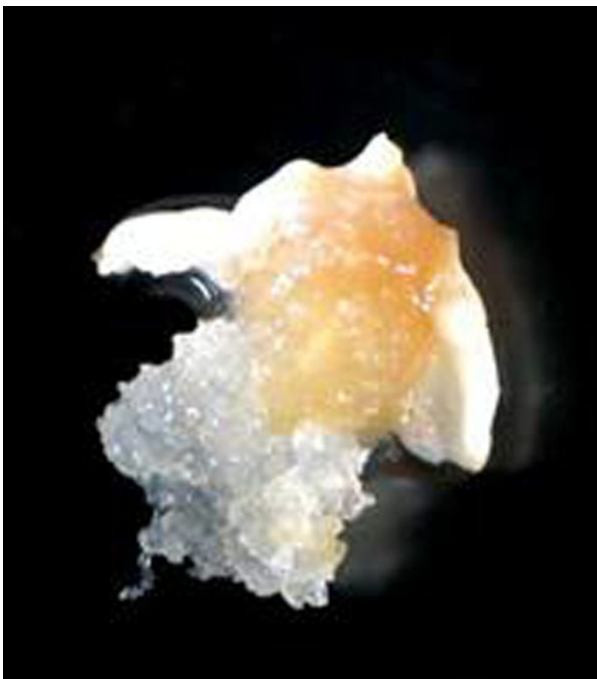
Figure 1 SE initiation from zygotic embryo of Norway spruce. ZE extracted from spruce seeds produced PEMs after 3-4 weeks in culture.

When whitish callus reached a size of 5x5 mm, it was isolated from primary explants and placed on proliferation medium for continuous growth.